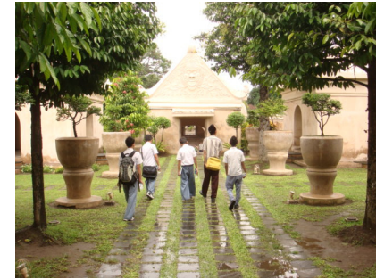
The front yard of castle