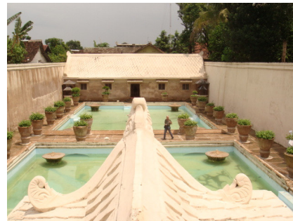
Bathing pool for the Queen