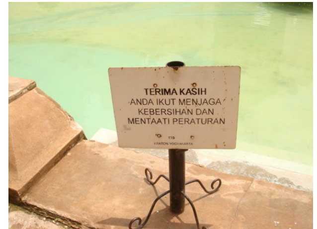
Sign to keep clean the area