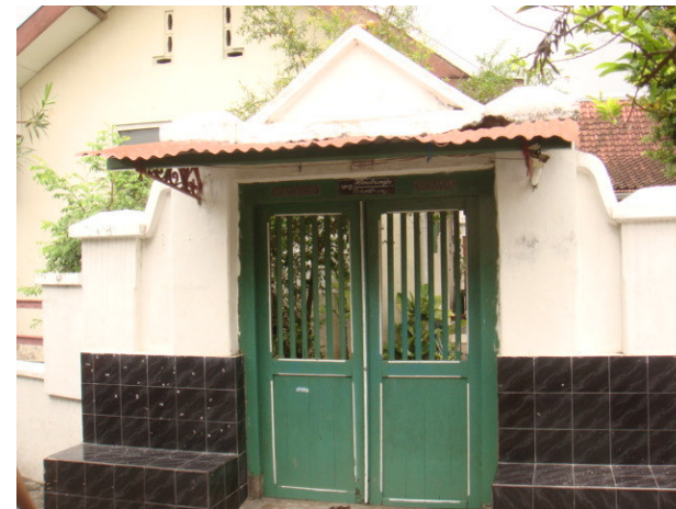
One of the houses