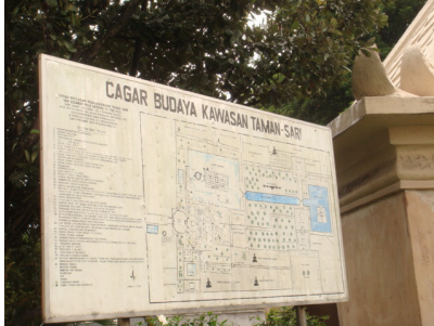
Map of taman sari

(click the picture for more information)