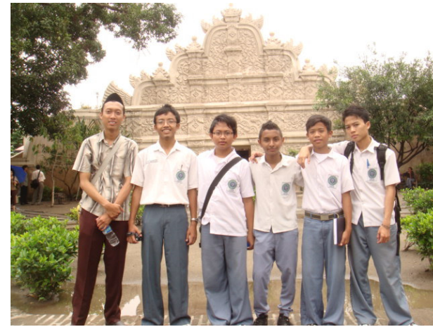
The exit gate