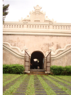
Entry gate of castle