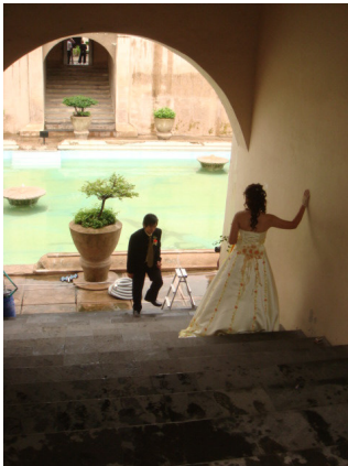
the exit from the pool