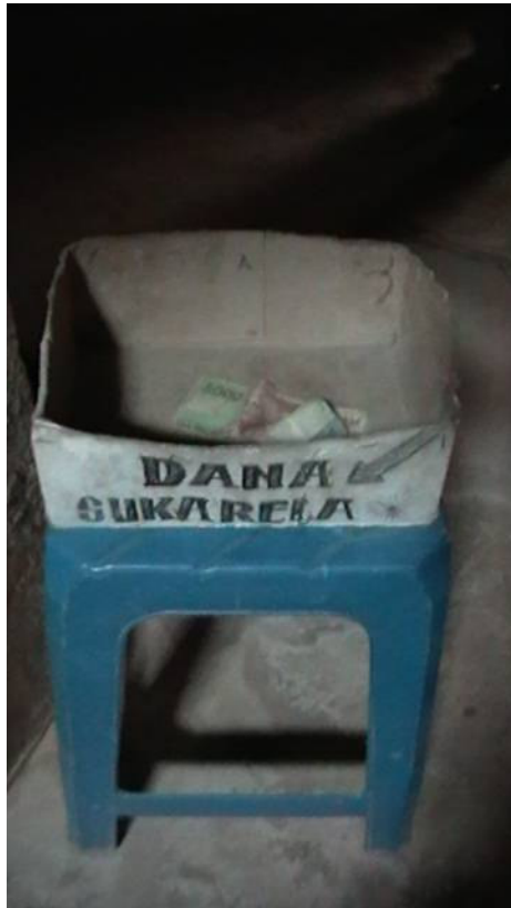
Donation for maintenance