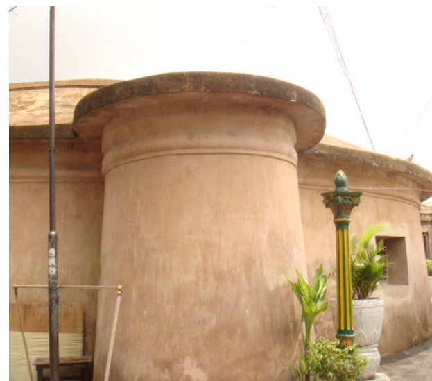
The under water mosque