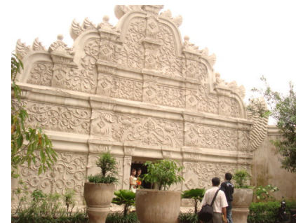
the exit gate of castle