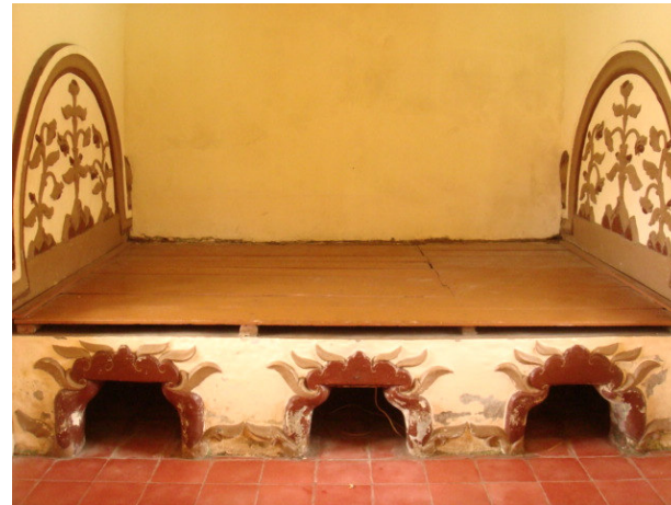
The Sultan's Bed