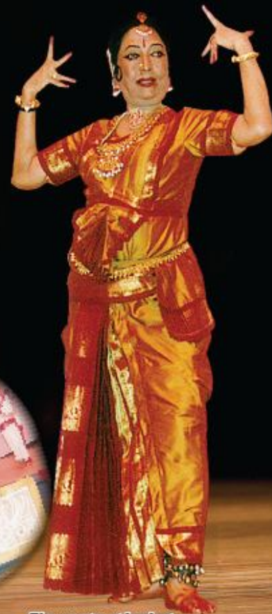
The maestro at her best