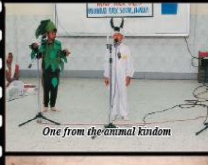
One from the animal kindom