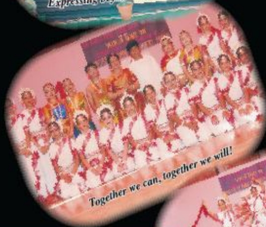
Together we can, together we will!