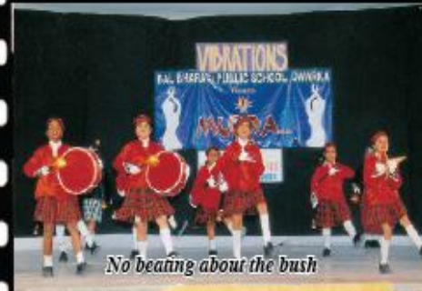
No beating about the bush