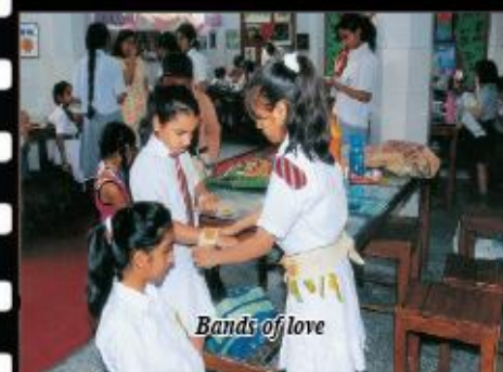
Bands of love