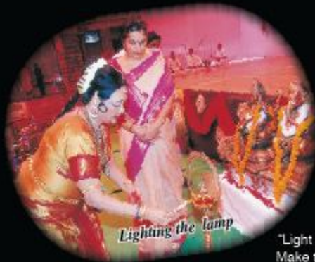
Lighting the lamp