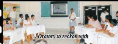
Oratory to reckon with