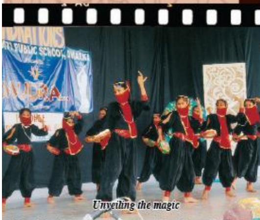
Unveiling the magic