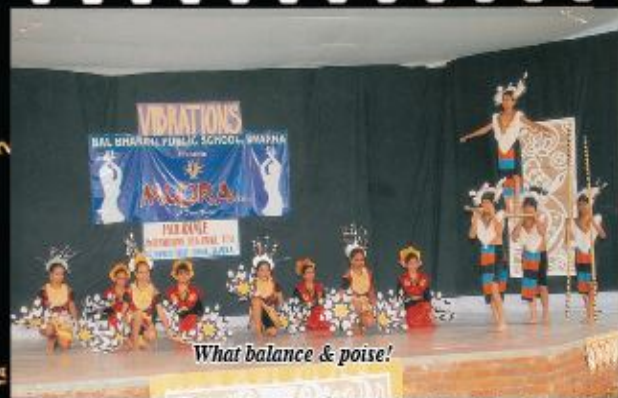
What balance & poise!

The school hosted mega annual inter-school event