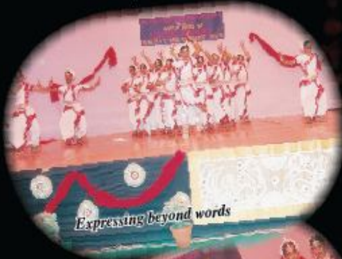
Expressing beyond words

The stage sizzled and audience were left mesmerized when Padmaahree Yamini Krishnamurthy exuberated sheer power and radiance through her celestial performance in the school on April 30, 2009 where she danced after thirty years. In her message she urged youngsters to take up learning of classical art forms with love and pursue them passionately not as vocation or hobby but for bringing about a life- transforming perspective through assimilation of traditionally inherited knowledge and art.