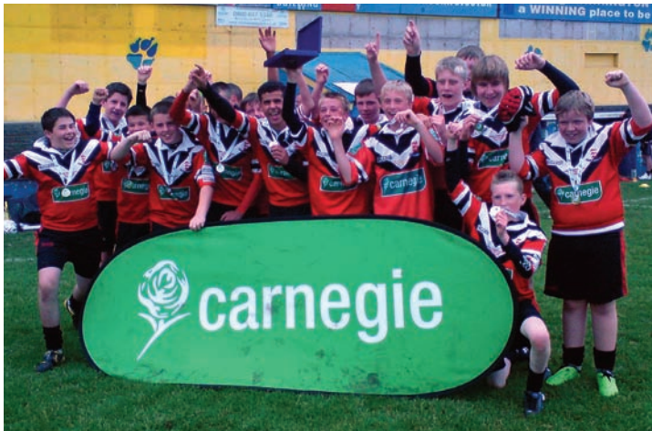
Year 8 Rugby League Champions

They beat St John Fisher, Wigan, 44-0. Year 11 were North West Rugby League Finalists, losing 26-13 to Sts Peter & Paul in Final at Stobart Stadium. Year 8 & Year 11 also reached the National Cup Quarter Finals. All Five Year Groups Qualified from Halton Stages into North West Rugby League Cup.