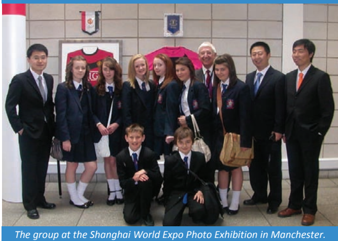
The group at the Shanghai World Expo Photo Exhibition in Manchester.