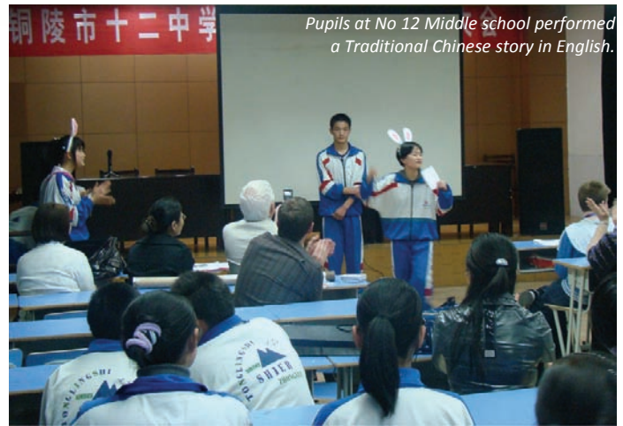
Pupils at No 12 Middle school performed a Traditional Chinese story in English.

China was an amazing experience for the pupils in the Chinese Club. The flight took a mere fourteen restless hours, but getting up at three o'clock in the morning was a real challenge. When we arrived we noticed that there was definite difference in culture, buildings and obviously, language. The Shanghai buildings towered above us, but we also drove past some of smaller poorer areas. During our trip we were fortunate to see some astounding ancient Chinese monuments; the Temple of Heaven, Jade Buddha Temple, Da Tong Village, Yu Yuen Gardens and the Forbidden City. The best of all the ancient monuments was the Great Wall of China. It is one of the seven wonders of the world. The actual size of it when you get there is amazing. It really does tire you out just walking along one of the stretches between stations. It is nowhere near as flat as you think!