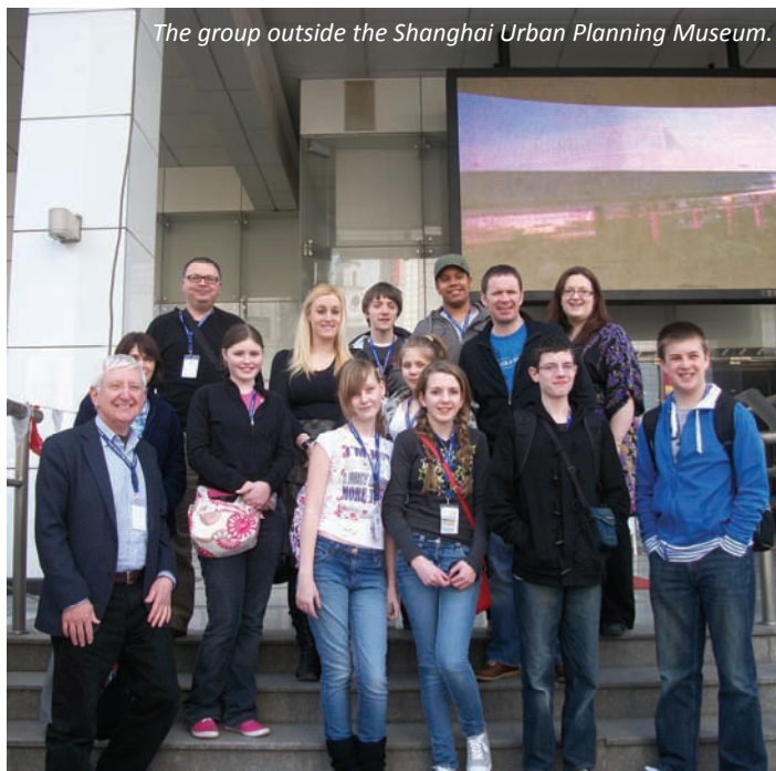
The group outside the Shanghai Urban Planning Museum.

The main reason for our visit to China was to be exposed to a different culture and a completely different type of school. A typical Chinese pupil arrives at school at seven and stays at school till five. This is a major difference to our high school times in the UK! We were lucky enough to also visit a primary school on the Sunday of our visit and a few dedicated pupils came to welcome us. During one of the many nights we were taken to a pupil's house for dinner with their parents, siblings and other relatives.